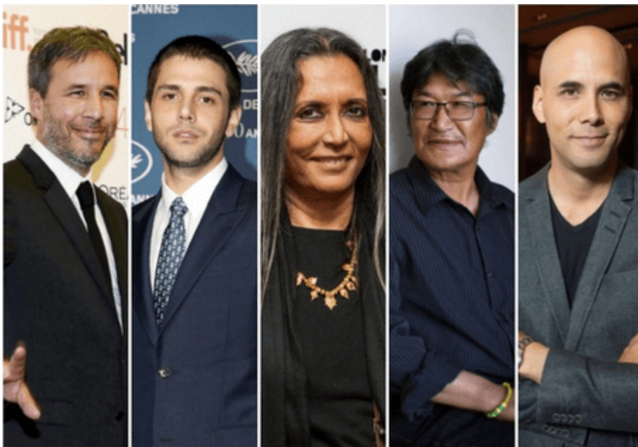
Canadian directors whose movies have been Canada's official

Hence, Canada's choices have overwhelmingly been French, although we've also submitted Kim Nguyen's French- and Lingala-language child-soldier tale War Witch , Deepa Mehta's Hindi-language romantic tragedy Water as well as Atanarjuat: The Fast Runner and The Necessities of Life , both starring main characters speaking Inuktituk.