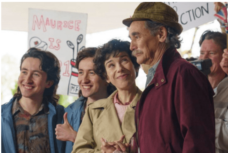
THE PHANTOM OF THE OPEN

The 2022 Santa Barbara International Film Festival (SBIFF), featuring 48 world premieres and 95 U.S. premieres from over 54 countries, along with tributes featuring the year's top talent, panel discussions, and free community education and outreach programs. The festival will start with the Opening Night Film, the U.S. Premiere of THE PHANTOM OF THE OPEN, a heartwarming British comedy starring Oscar winners Sally Hawkins and Mark Rylance, on Wednesday, March 2nd, 8:00 P.M., at the historic Arlington Theatre in downtown Santa Barbara, Calif. The Opening Night Film will be presented by UGG.