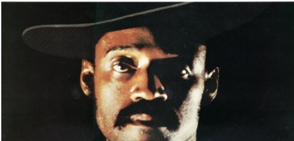
Sweet Sweetback's Baadasssss Song

The birth of Blaxploitation began with Melvin Van Peebles' Sweet Sweetback's Baadasssss Song , with initiating a new black identity and reached its zenith with Gordon Parks, Jr.'s Superfly . In its purest form, blaxploitation gave these filmmakers voices to explore the prominent social and cultural issues and characteristics, including police brutality, prostitution, illegal drug distribution conspiracies and attempts by law enforcement officials to establish control and maintain order in large, inner-city, urban environments in their respective films, Sweet Sweetback's Baadasssss Song , and Superfly , while using creative license in themes, costumes, props and soundtracks to shape characters.