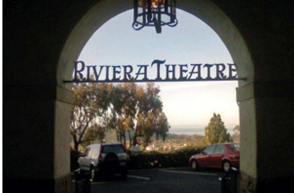
Entry way of the Santa Barbara Riviera Theater.