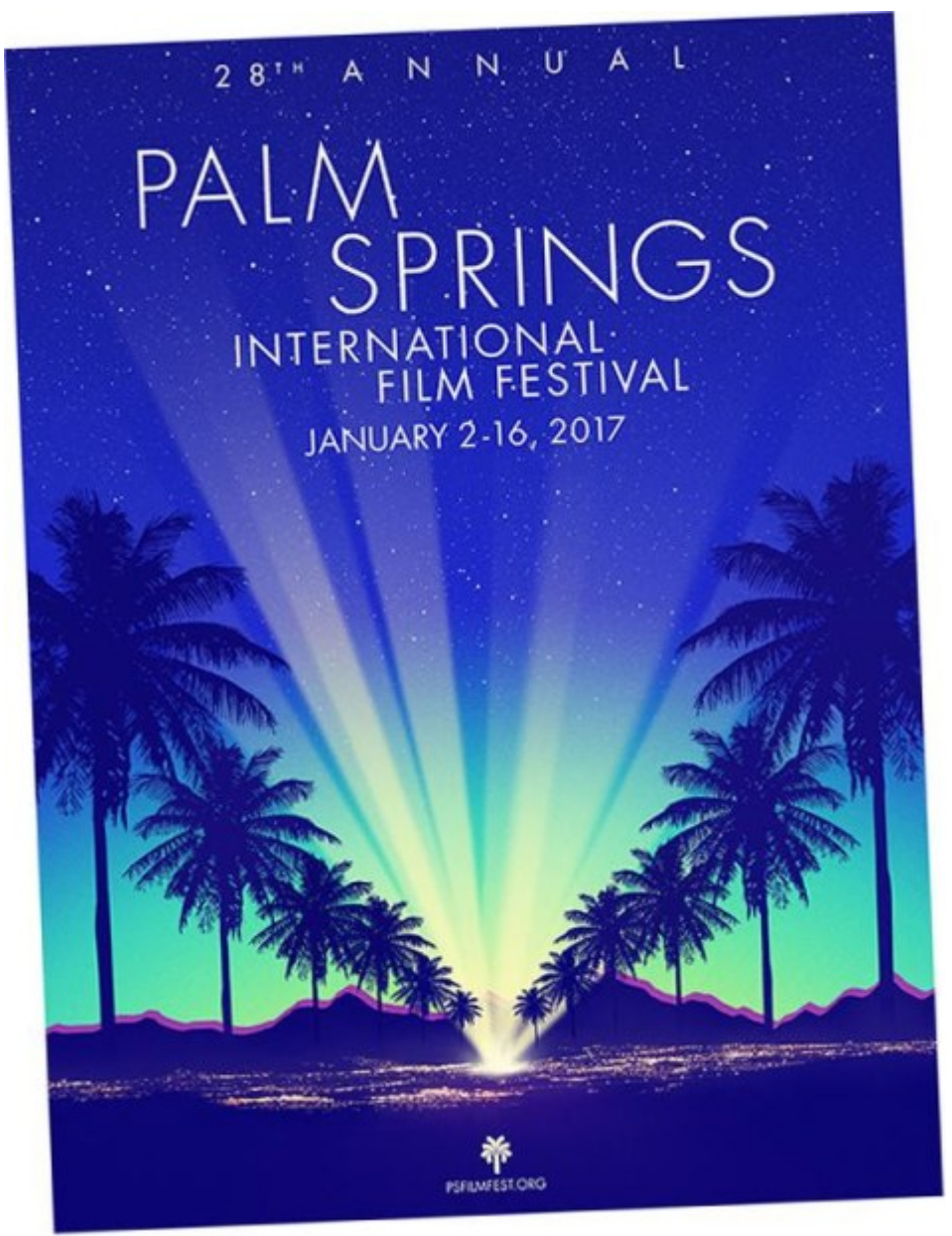
You can read the official 2017 Palm Springs International Film Festival Souvenir Program Book online. Just click HERE.