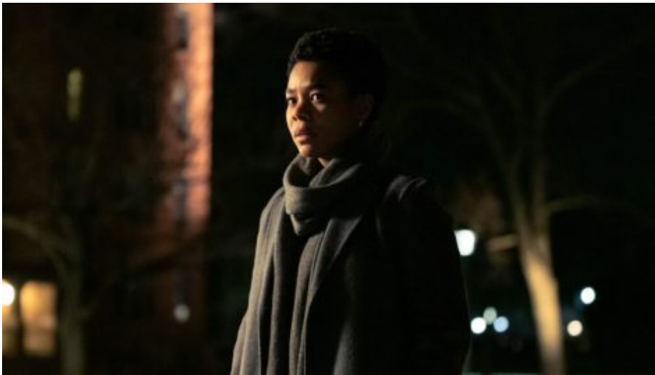
Regina Hall appears in Master by Mariama Diallo, an official selection of the U.S. Dramatic Competition.