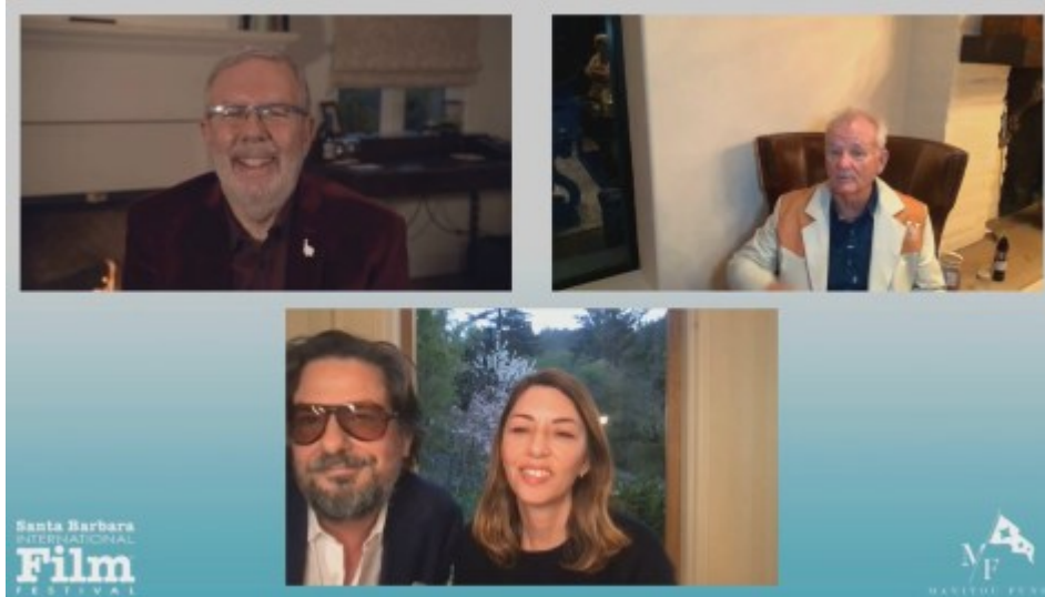
Roman Coppola, lower left, with sister Sofia Coppola, lower right, presented Bill Murray, upper right

During Murray's conversation with Maltin, guests enjoyed nostalgic clips of his film career, including Caddyshack , Ghostbusters , Groundhog Day , Rushmore , The Royal Tenenbaums , Lost in Translation , St. Vincent , On the Rocks , and more.