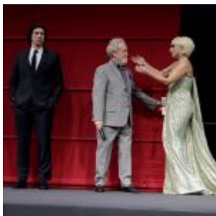
Adam Driver, Director Ridley Scott and Lady Gaga