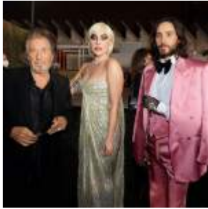
Al Pacino, Lady Gaga and Jared Leto