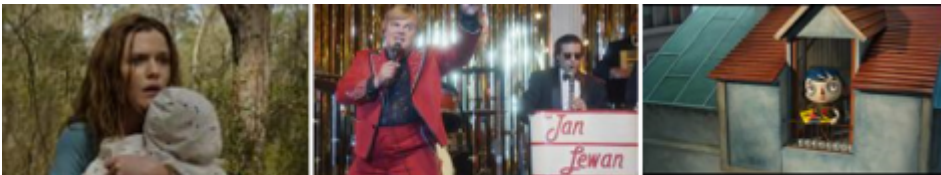
(L-R) The Killing Ground, The Polka King, My Life as a Zucchini

Three projects announced today are part of The New Climate, the Festival's new environmental program: Rancher, Farmer, Fisherman (Documentary Premieres), Look & See: A Portrait of Wendell Berry (Spotlight) and RISE (Special Events).