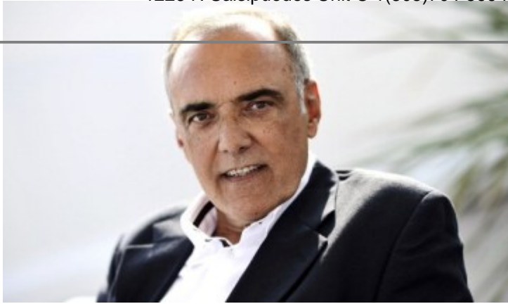
The Director of the Venice Film Festival,