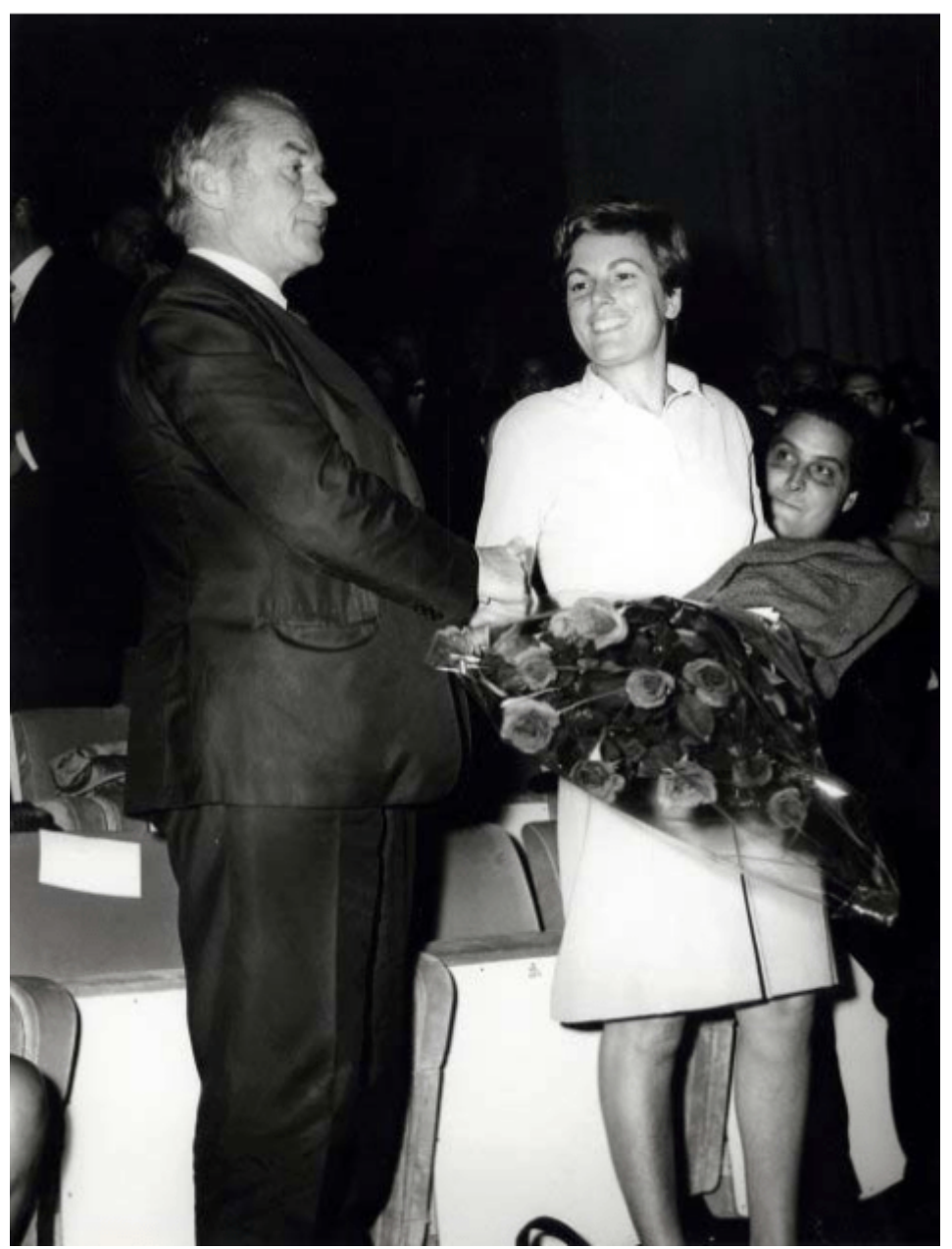
1968 : Liliana Cavani receives a bouquet in Sala Grande, shortly before the official screening of her film, Galileo, presented in Competition. Standing next to her is the star of the film, South African Cyril Cusack.