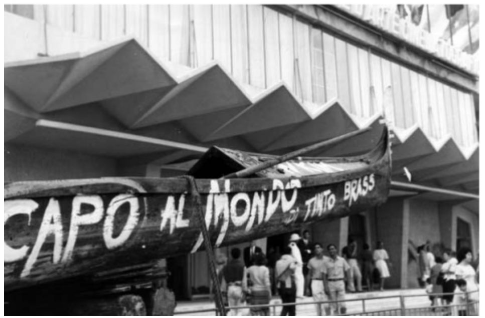
The gondola hoisted in front of the Palazzo del Cinema to promote Tinto Brass' 1963 film, Chi Lavora e Perduto.