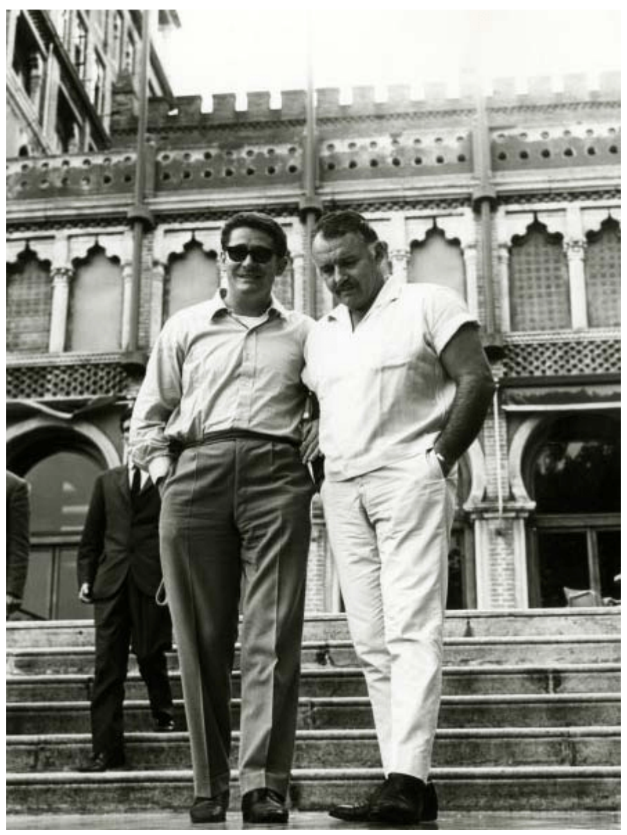
1965 : Ermanno Olmi and Rod Steiger talk as they descend the staircase of the Hotel Excelsior on the way to the beach. The director was at the Venice Film Festival, Out of Competition, with the film A Man Called John , a tribute to the figure of Pope John XXIII, starring Steiger and Adolfo Celi.