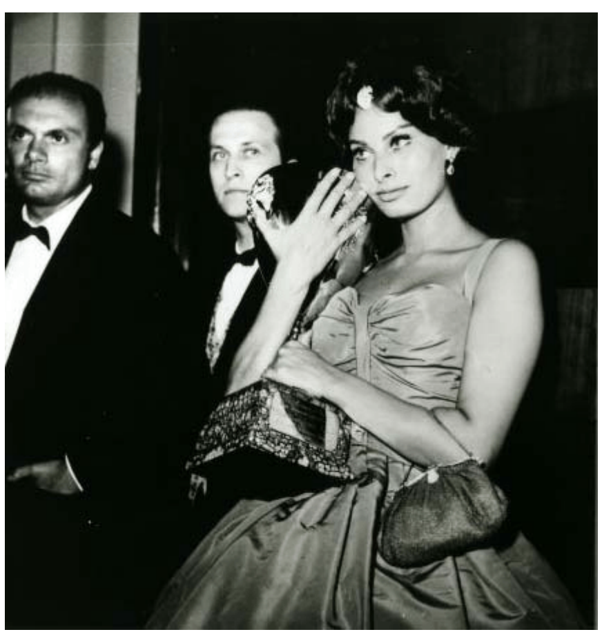
1958: Sophia Loren is thrilled to embrace the Coppa Volpi for Best Actress which she had just won for the film Black Orchid by Martin Ritt.

, by Lucchino Visconti, which would win the Golden Lion as Best Film.