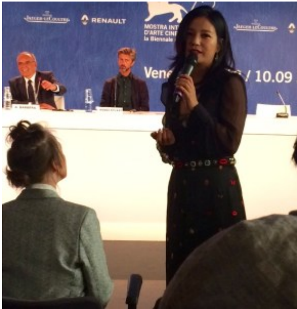
Chinese screen starlet, Zhao Wei, addresses the audience at the 2016 Venice International Film Festival's Opening Press Conference.

The conference was quickly opened up to audience members for questions. One of the first questions came from a Chinese agency asking the lovely Zhao Wei, the first Chinese female to sit on the VENEZIA Jury, what she was looking for in films.