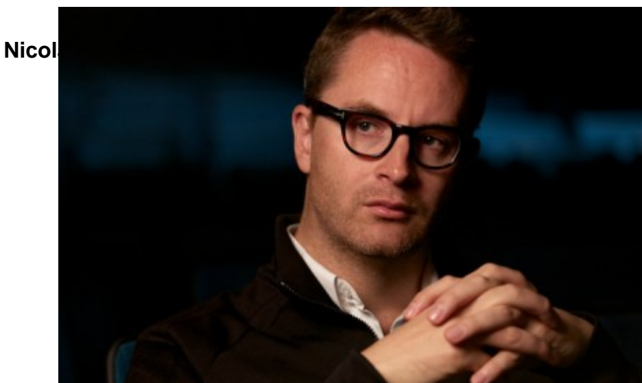
"I had always considered

Zombi is being re-released after so many years. Titanus, the distributor at the time, considered it a very strange film with too much action: the music was too extreme, they thought it would not be well received and I was a little scared myself by this terrible prophecy. I didn't know what to do so I said: «Ok, let's screen the world premiere in Turin, a city I love because that is where I filmed Deep Red; if it doesn't do well there, we can do away with it». It was a Friday afternoon and I was rather terrified as I went to the theatre; but I remember seeing a lot of people as I walked over from the hotel and thought: so it can't be going that bad!.. and in fact when I got there it was packed; I went in and thanked everyone for coming. The film was being shown after a lengthy series of mishaps in Italy: the censors made me cut out a lot of scenes, and as a result I withdrew it. They were asking me to cut far too much; I remember even thinking that the editing would no longer be comprehensible, so I made a series of small cuts, fixed it up a little, and was able to swing an emergency procedure (usually the censors take up to six months to review a film again). When the film was finally released it was forbidden to minors under the age of eighteen which, in my mind, was fairly serious, because we had conceived it for an audience of young people... I have a great memory of Zombi because it was so important for my career and for George's as well".