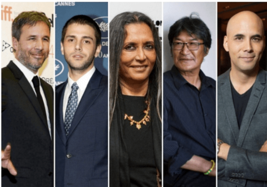
Canadian directors whose movies have been Canada's official

Hence, Canada's choices have overwhelmingly been French, although we've also submitted Kim Nguyen's French- and Lingala-language child-soldier tale War Witch , Deepa Mehta's Hindi-language romantic tragedy Water as well as Atanarjuat: The Fast Runner and The Necessities of Life , both starring main characters speaking Inuktituk.