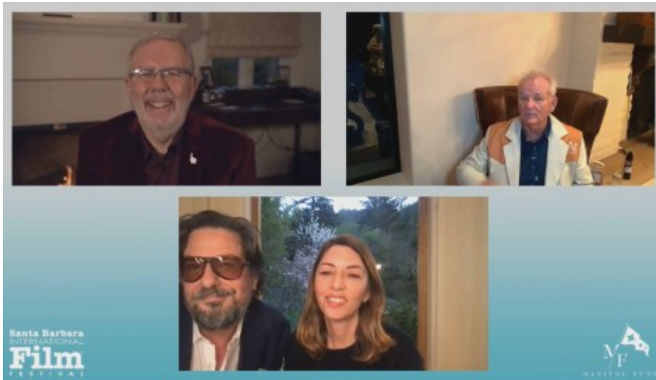
Roman Coppola, lower left, with sister Sofia Coppola, lower right, presented Bill Murray, upper right (SBIFF)

During Murray's conversation with Maltin, guests enjoyed nostalgic clips of his film career, including Caddyshack , Ghostbusters , Groundhog Day , Rushmore , The Royal Tenenbaums , Lost in Translation , St. Vincent , On the Rocks , and more.