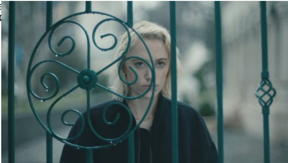
Maika Monroe appears