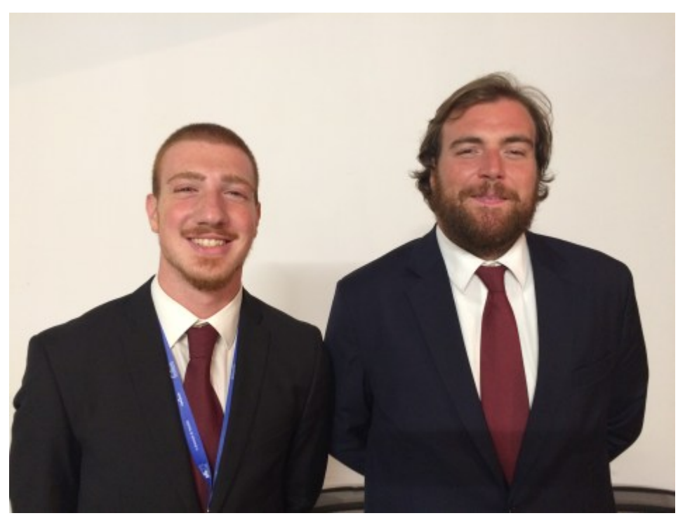
Ushers at the 73rd Venice International Film Festival.

A special note of thanks to this year's ushers for their efforts in ensuring my safety and well-being at the 73rd Venice International Film Festival. Until next year, Ciao'!