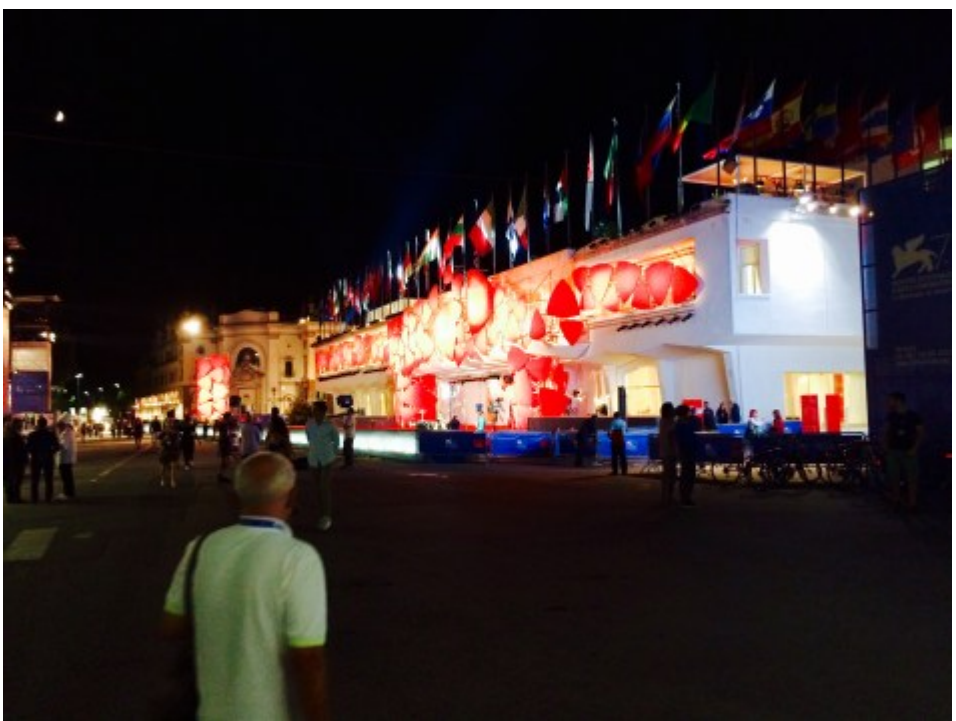
Last night and final view of the 73rd Venice International Film Festival. (Photo credit: Larry Gleeson/

Festival. (Photo credit: Larry Gleeson/HollywoodGlee)