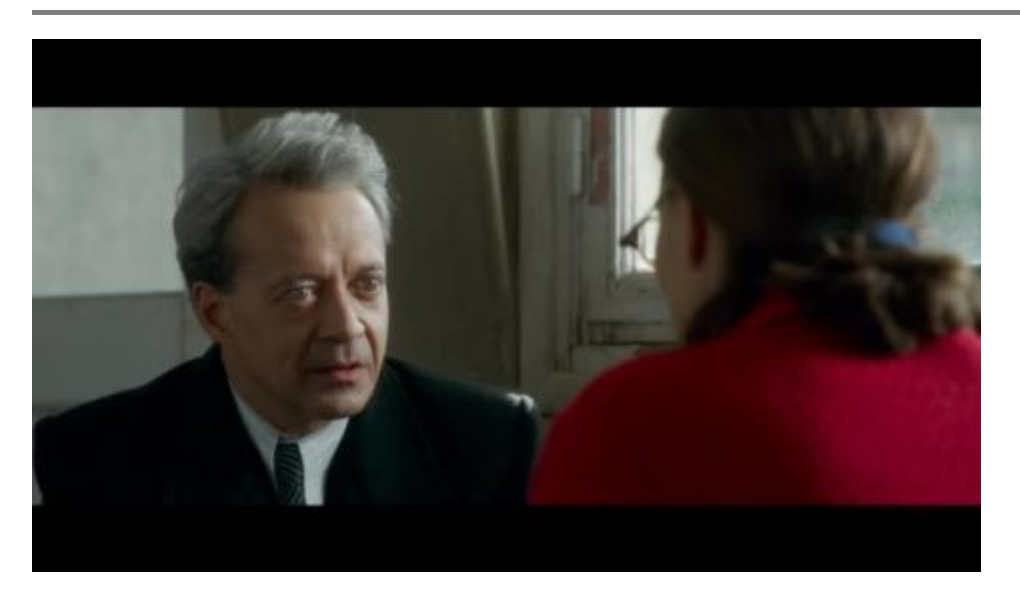
You do not have sufficient freedom levels to view this video. Support free software and upgrade.