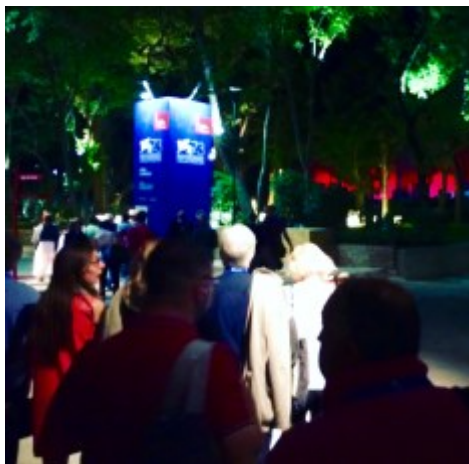
Cinema patrons makeing their way between venues during the 73rd Venice International Film