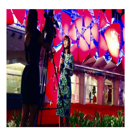
Wrap Up: 73rd Venice International Film Festival Continues to Mesmerize