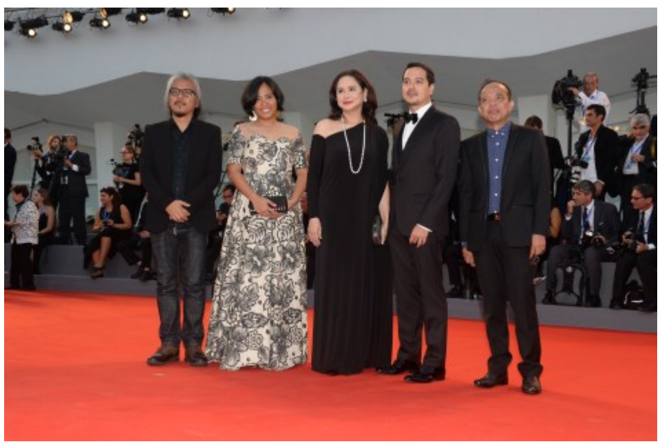
Director Lav Diaz, left, with Ang Babaeng Humayo film delegation at the 73rd Venice International Fi

Land Press Conference on Augsut 31st, 2016, at the 73rd Venice International Film Festival.