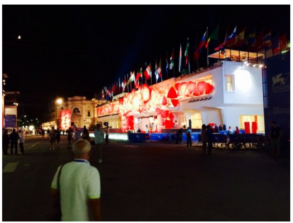
Last night and final view of the 73rd Venice International Film Festival. (Photo credit: Larry Gleeson/

Festival. (Photo credit: Larry Gleeson/HollywoodGlee)