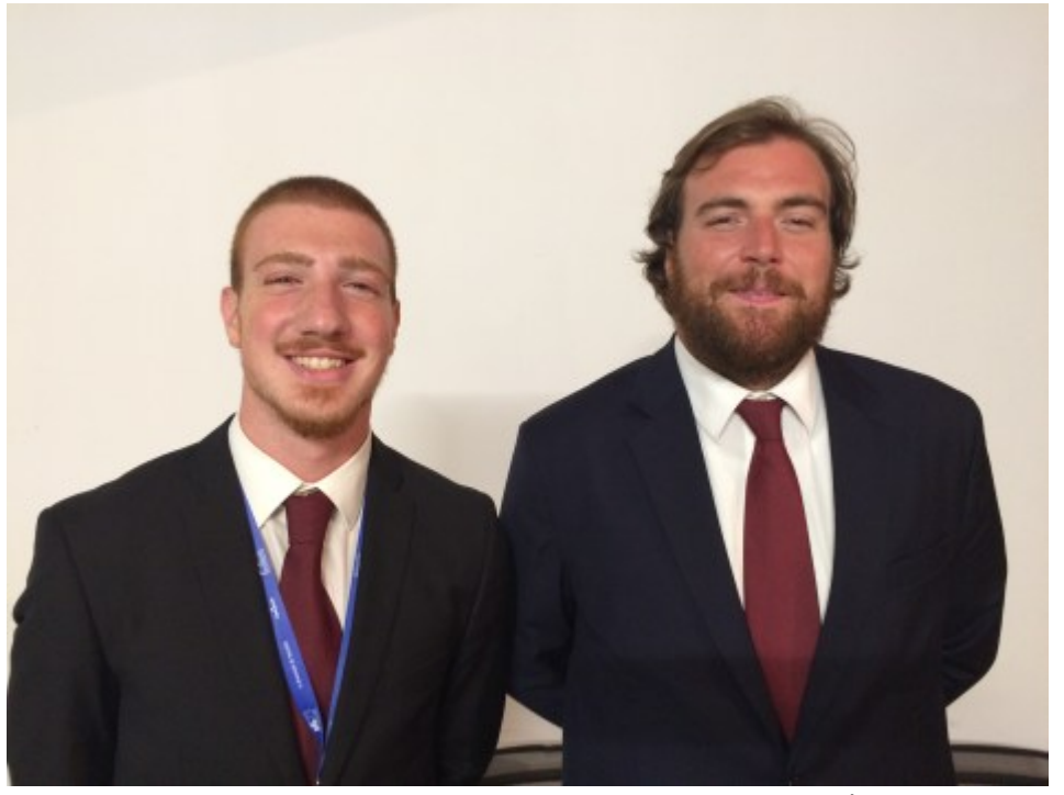
Ushers at the 73rd Venice International Film Festival.

A special note of thanks to this year's ushers for their efforts in ensuring my safety and well-being at the 73rd Venice International Film Festival. Until next year, Ciao'!