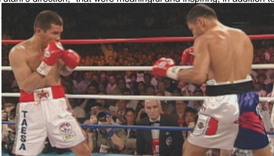
Oscar de la Hoya and

Julio Cesar Chavez appear in La Guerra Civil by Eva Longoria Bastón, an official selection of the Premieres section at the 2022 Sundance Film Festival.