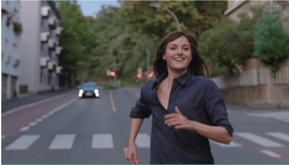
The Worst Person In

American cultural lens. What emerges is a very intimate look at both boxers and their impact on the dichotomy of what it means to be Mexican and what it means to be Mexican-American. Four stars.