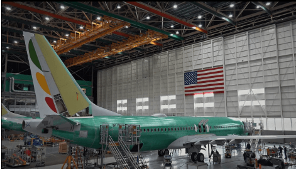
Downfall: The Case

they quickly realize that the American dream is not as easy to achieve as they thought. The cast and crew – simply superb.