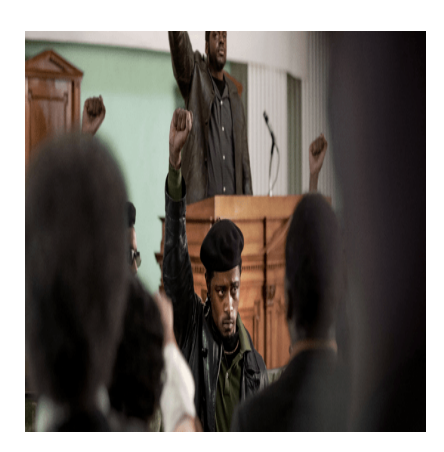
Judas and The Black Messiah