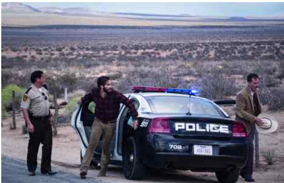
(l-r.) Academy Award nominees Jake Gyllenhaal and Michael Shannon star as Tony Hastings and Bobby Andes

Moved by Edward's writing, Susan cannot help but reminisce over the most private moments from her own love story with the author. Trying to look within herself and beyond the glossy surface of the life and career that she has made, Susan increasingly interprets the book as a tale of revenge, a tale that forces her to re-evaluate the choices that she has made, and re-awakens a love that she feared was lost – as the story builds to a reckoning that will define both the novel's hero and her own.