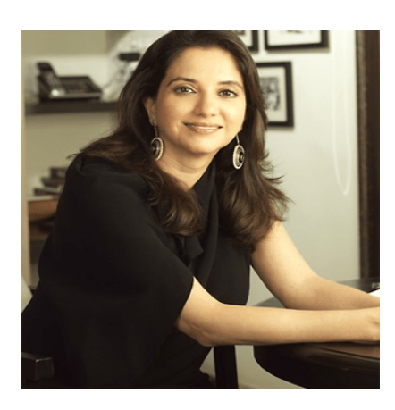
MUMBAI FILM FESTIVAL TO PROMOTE CULTURAL EXCHANGE WITH BHUTAN