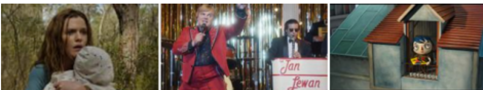
(L-R) The Killing Ground, The Polka King, My Life as a Zucchini

Three projects announced today are part of The New Climate, the Festival's new environmental program: Rancher, Farmer, Fisherman (Documentary Premieres), Look & See: A Portrait of Wendell Berry (Spotlight) and RISE (Special Events).