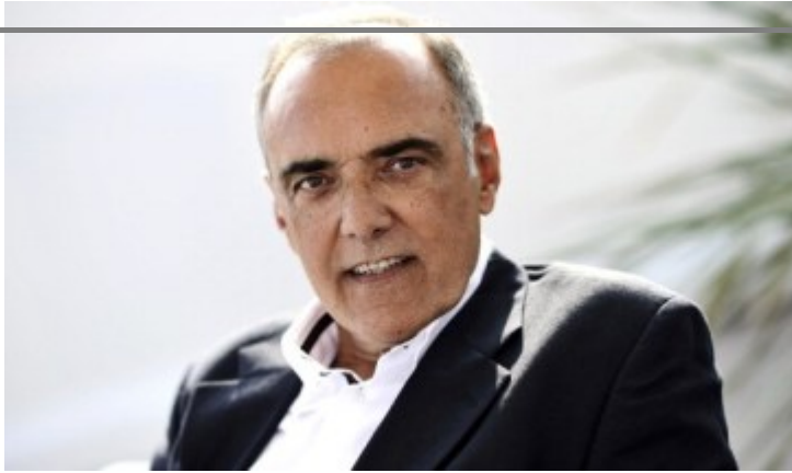
The Director of the Venice Film Festival,

Alberto Barbera , made the following statement about the award: “ Amir Naderi gave fundamental impetus to the birth of the New Iranian Cinema during the 1970s and ‘80s with a number of masterpieces destined to leave their mark on the history of cinema, such as Davandeh ( The Runner , 1985) and Ab, bād, khâk ( Water, Wind, Dust , 1988). But even after moving to New York in 1988, Naderi remained stubbornly true to himself and to a type of cinema dedicated to research and experimentation, which refuses to bow to trends and easy shortcuts. Every film he has made clearly displays the nucleus of an identical obsession which transcends the principle of reality in order to force individuals beyond their own limits. The last half hour of Monte is a sort of synthesis of his entire opus, a larger-than-life metaphor of a struggle for survival prevailing over the dividing lines, intimidations and insults which can sometimes make human existence miserable. The breathtaking epilogue transforms the ideas, emotions and visions at the basis of all his films into powerfully expressive images. The Jaeger-LeCoultre Award is a well-deserved recognition, a tribute to the originality and greatness of a filmmaker who stands out from the crowd, the talent of a passionate director, and the generosity of a man who seems to know no limits.”