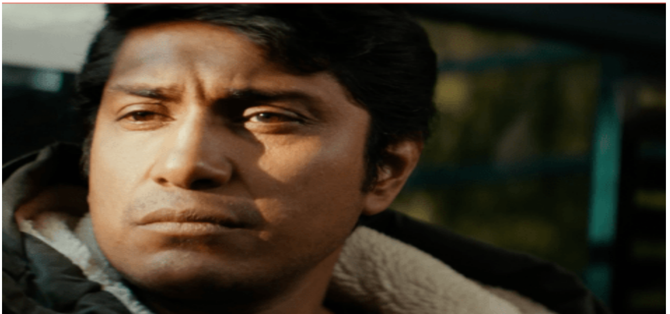
Son of Monarchs

Son of Monarchs has been awarded the 2021 Alfred P. Sloan Feature Film Prize and received a $20,000 cash award from the Alfred P. Sloan Foundation. The Prize is selected by a jury of film and science professionals and presented to an outstanding feature film focusing on science or technology as a theme, or depicting a scientist, engineer or mathematician as a major character, and will be recognized at the 2021 Sundance Film Festival closing Awards Night.