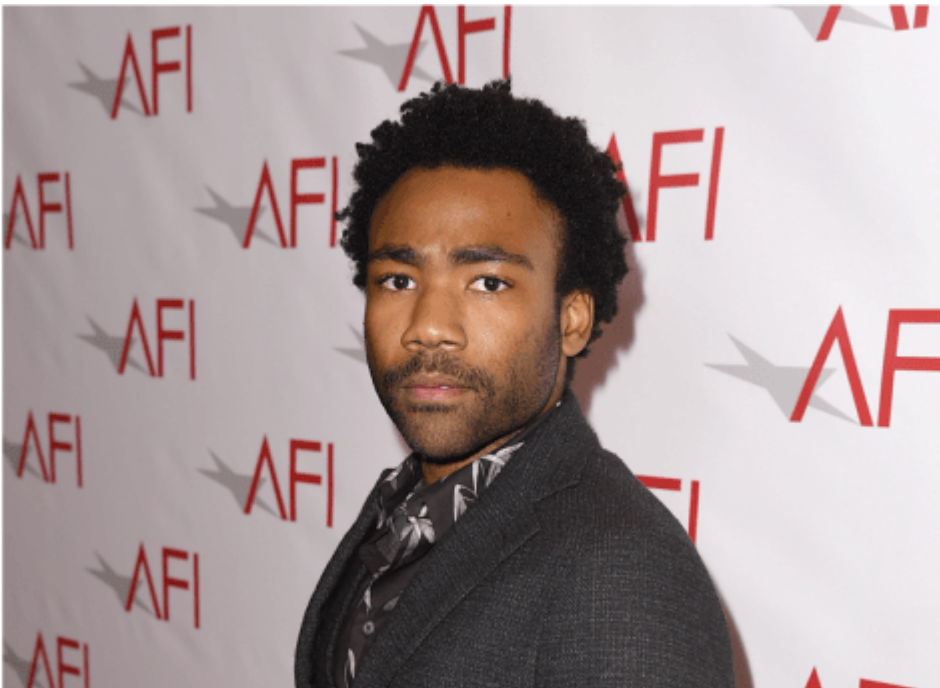
Donald Glover from ATLANTA at the AFI AWARDS 2016 luncheon at the Four Seasons in Beverly Hills, CA, on January 6, 2017.