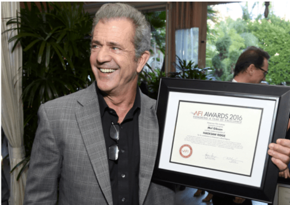
Mel Gibson poses with his AFI AWARDS 2016 certificate at the AFI AWARDS 2016 luncheon at the Four Seasons in Beverly Hills, CA, on January 6, 2017.