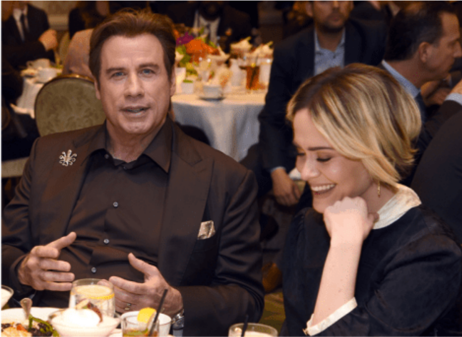
John Travolta and Sarah Paulson from THE PEOPLE V O.J. SIMPSON: AMERICAN CRIME STORY at the AFI AWARDS 2016 luncheon at the Four Seasons in Beverly Hills, CA, on January 6, 2017.