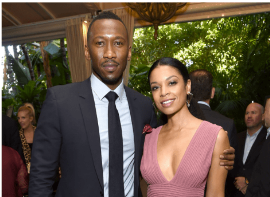
Mahershala Ali (MOONLIGHT) and Susan Kelechi Watson (THIS IS US) at the AFI AWARDS 2016 luncheon at the Four Seasons in Beverly Hills, CA, on January 6, 2017.