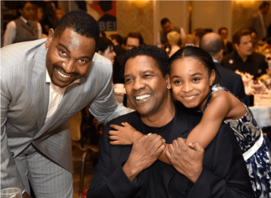
Mykelti Williamson actor/director Denzel Washington and actress Saniyya Sidney from FENCES at the AFI AWARDS 2016 luncheon at the Four Seasons in Beverly Hills, CA, on January 6, 2017.