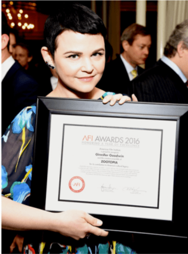
Ginnifer Goodwin from ZOOTOPIA at the AFI AWARDS 2016 luncheon at the Four Seasons in Beverly Hills, CA, on January 6, 2017.