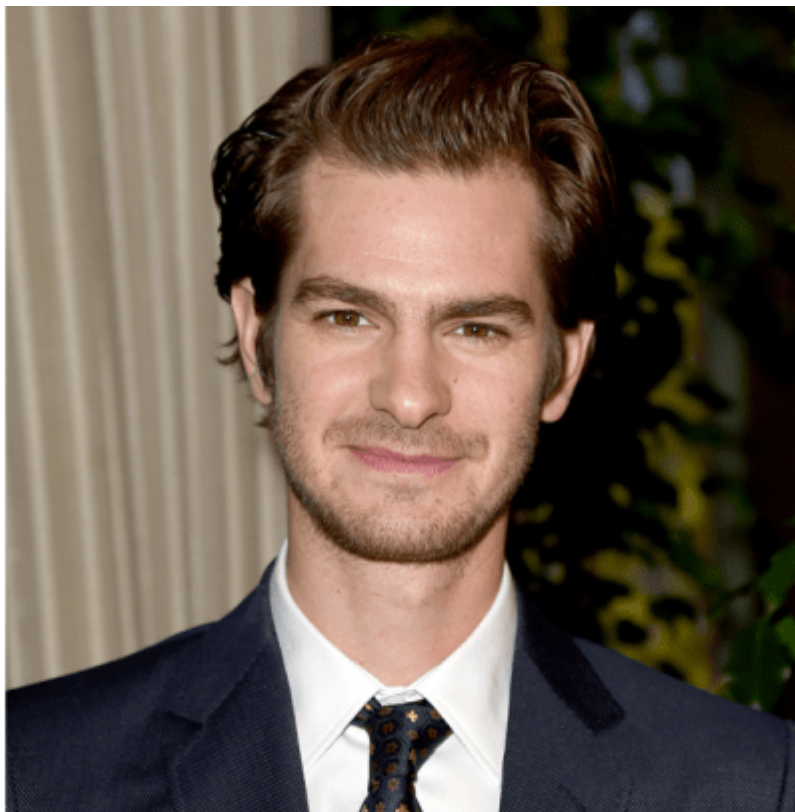
Andrew Garfield (HACKSAW RIDGE, SILENCE) at the AFI AWARDS 2016 luncheon at the Four Seasons in Beverly Hills, CA, on January 6, 2017.