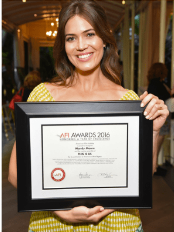
THIS IS US star Mandy Moore at the AFI AWARDS 2016 luncheon at the Four Seasons in Beverly Hills, CA, on January 6, 2017.