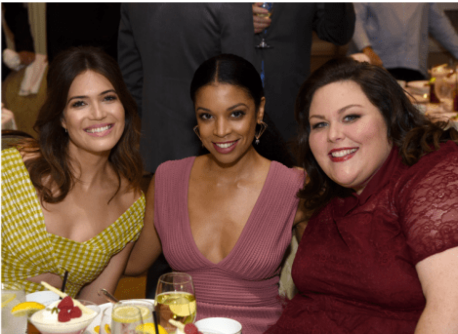
THIS IS US stars Mandy Moore, Susan Kelechi Watson and Chrissy Metz at the AFI AWARDS 2016 luncheon at the Four Seasons in Beverly Hills, CA, on January 6, 2017.