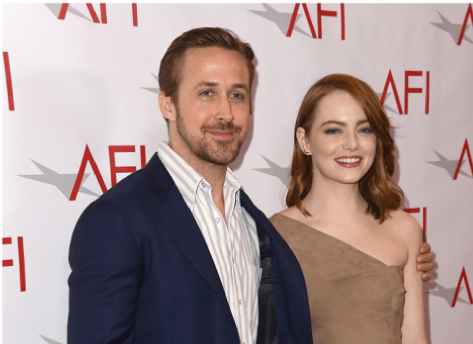
Ryan Gosling and Emma Stone (LA LA LAND) at the AFI AWARDS 2016 luncheon at the Four Seasons in Beverly Hills, CA, on January 6, 2017.

There are no winners or losers at AFI AWARDS. Instead, AFI recognizes all of the creative ensembles behind the year's most outstanding storytelling in film and television. The talented members of these teams gathered in Beverly Hills yesterday to be honored at the AFI AWARDS 2016 luncheon. Guests at the event included the best of the best in the entertainment community, such as Clint Eastwood, Ryan Gosling, Naomi Harris, Chris Pine, Michelle Williams and more.