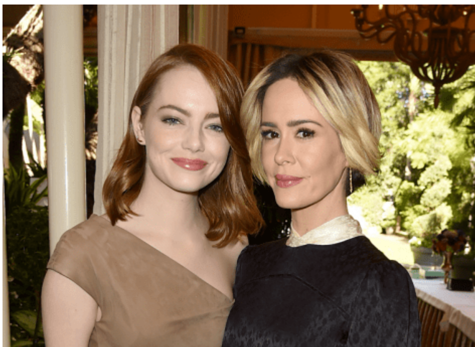
Emma Stone (LA LA LAND) and Sarah Paulson (THE PEOPLE V. O.J. SIMPSON: AMERICAN CRIME STORY) at the AFI AWARDS 2016 luncheon at the Four Seasons in Beverly Hills, CA, on January 6, 2017.