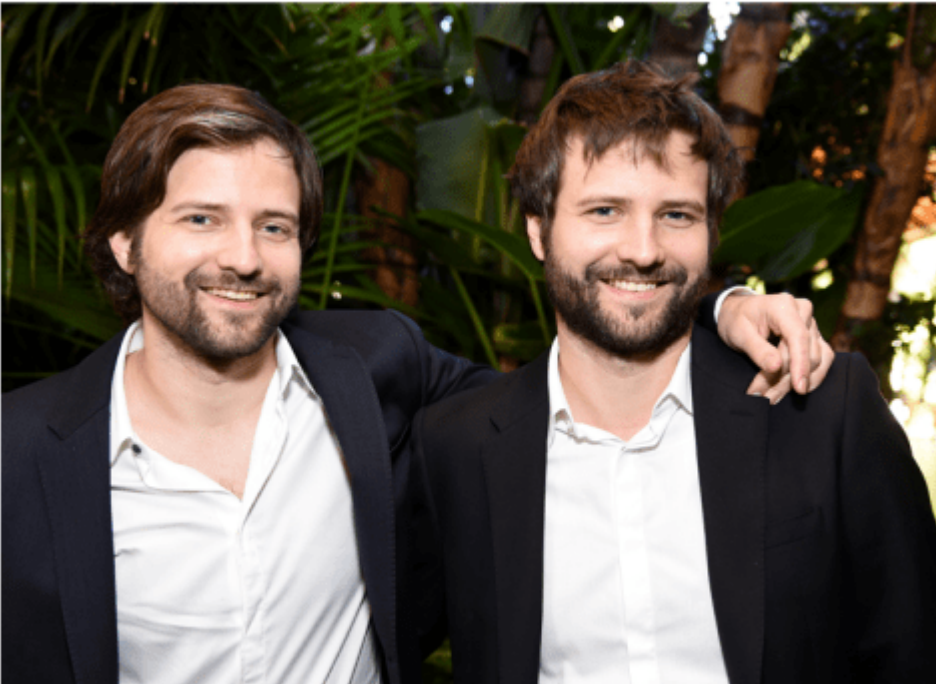
The Duffer Brothers (STRANGER THINGS) at the AFI AWARDS 2016 luncheon at the Four Seasons in Beverly Hills, CA, on January 6, 2017.