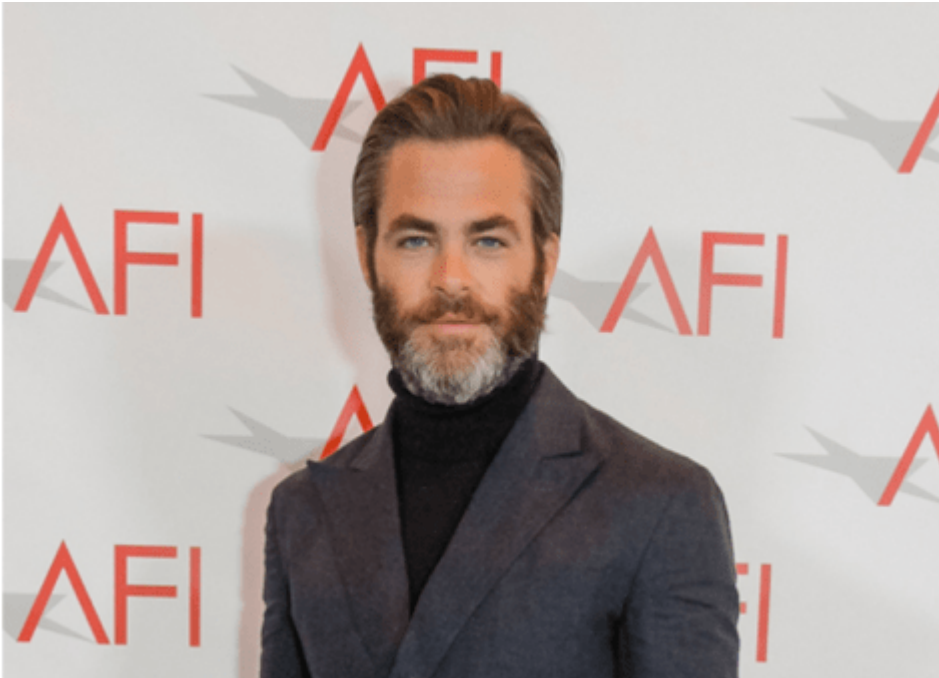
HELL OR HIGHWATER's Chris Pine at the AFI AWARDS 2016 luncheon at the Four Seasons in Beverly Hills, CA, on January 6, 2017.