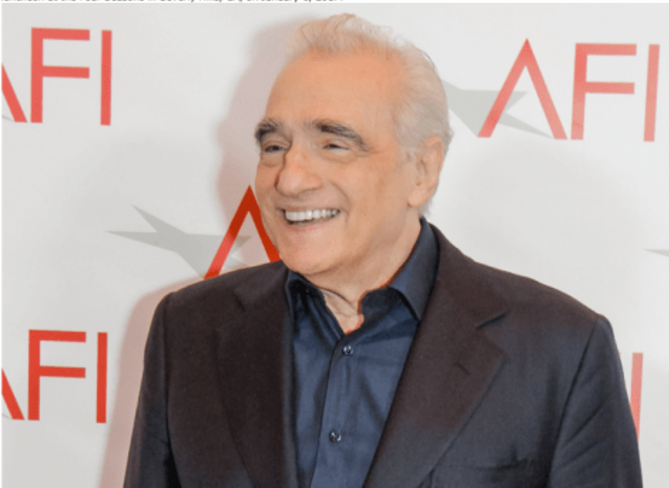
SILENCE director Martin Scorsese at the AFI AWARDS 2016 luncheon at the Four Seasons in Beverly Hills, CA, on January 6, 2017.