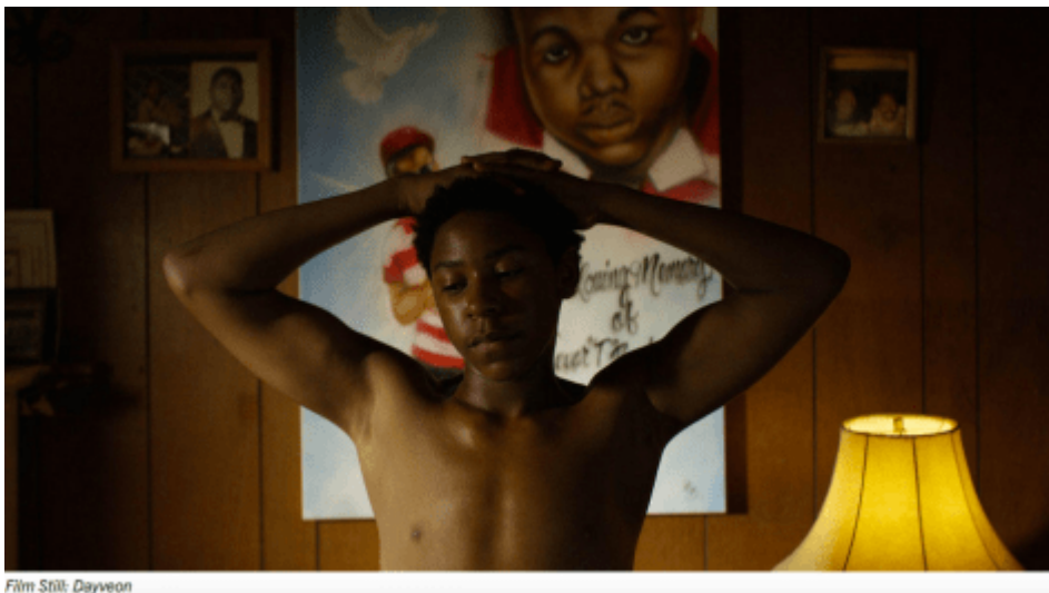
Film Still: Dayveon

TG: I’m very encouraged by the fact that we have several NEXT category alumni in our Competition category, and vice versa. NEXT was always intended to be a place to showcase the most adventurous and bold feature films in our lineup, and more filmmakers are rising to that lofty goal every year. It’s harder and harder for us to pick only 10 films to include here.