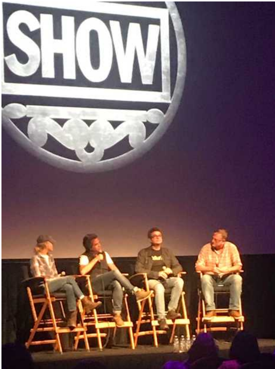
Judy Director, Rupert Goold, explains his directorial style during a Q & A following a screening at the