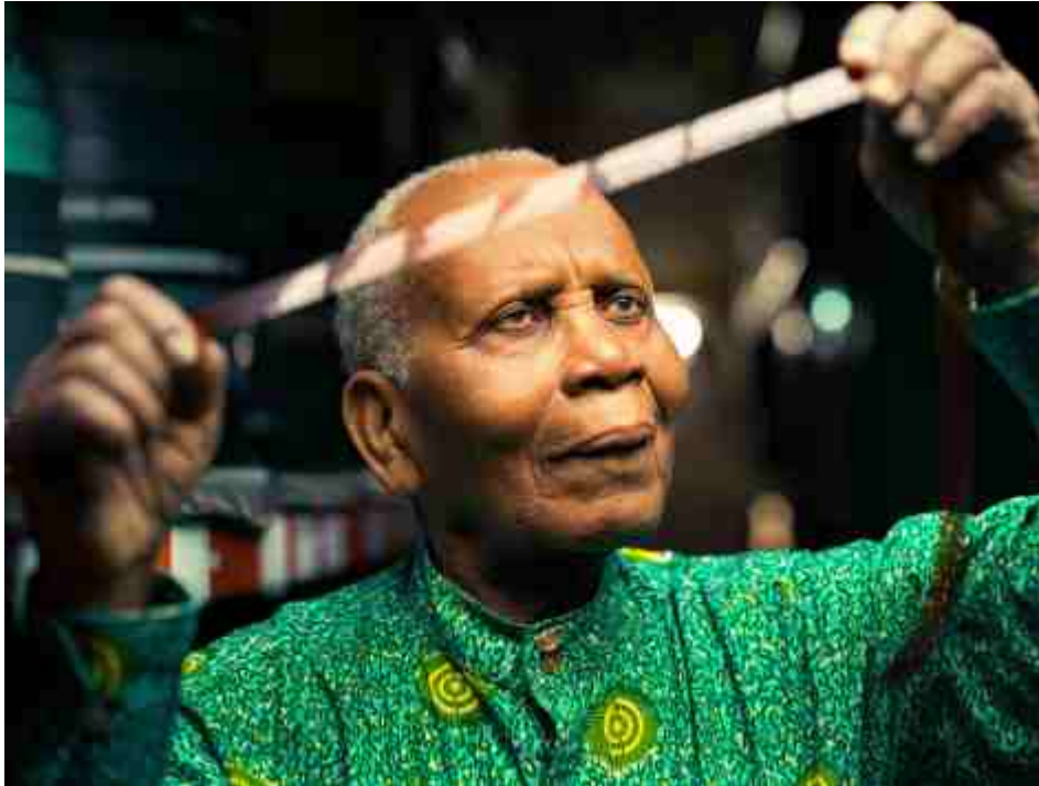
The Eyes Of Ghana

Laguna Beach, CA (October 27, 2025) —The Coast Film & Music Festival (CFMF) has unveiled the full film slate for its seventh annual event, taking place Saturday, November 1 through Sunday, November 9. The schedule includes 16 features and 73 shorts, with screenings at the following venues: the Laguna Beach Cultural Arts Center, the Festival of Arts, the Rivian South Coast Theater, The Promenade on Forest, and the Hobie Surf Shop.