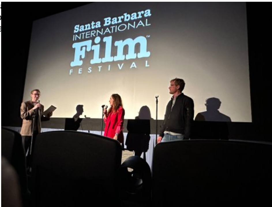
SBIFF Q&amp;A with