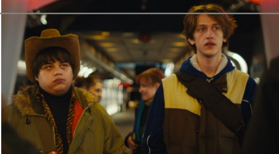
I Like Movies