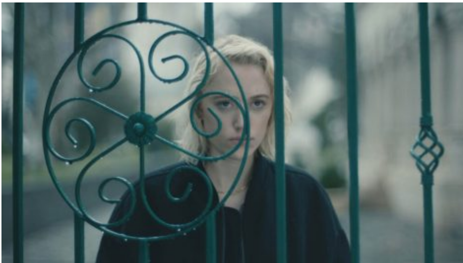
Maika Monroe appears in Watcher by Chloe Okuno, an official selection of the U.S. Dramatic Competition.