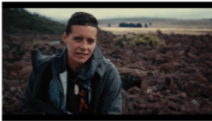
THIS IS THE WAY WE RISE