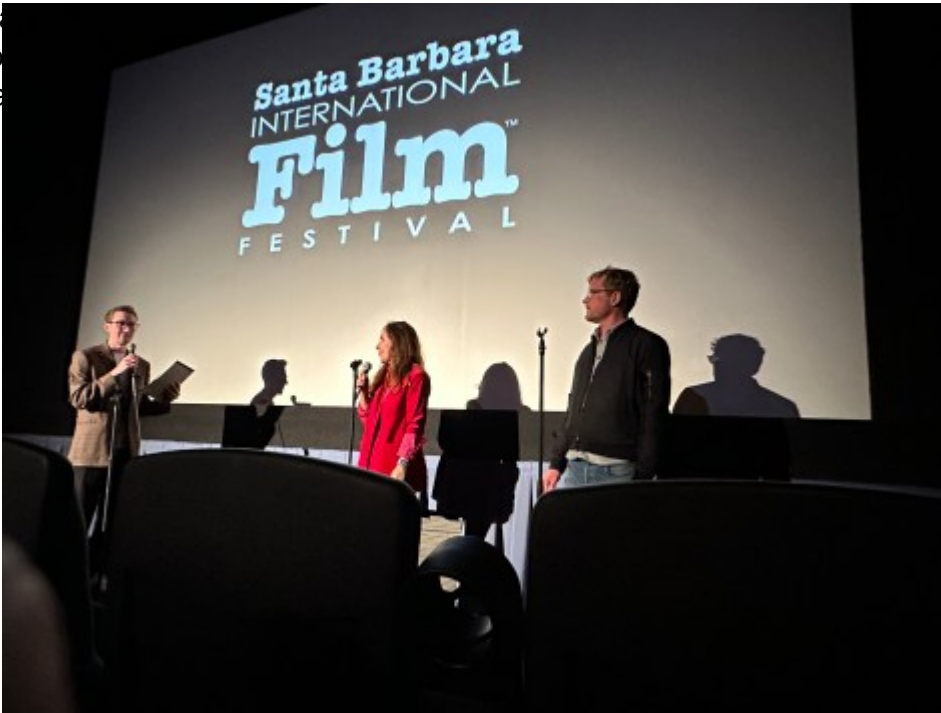
SBIFF Q&A with