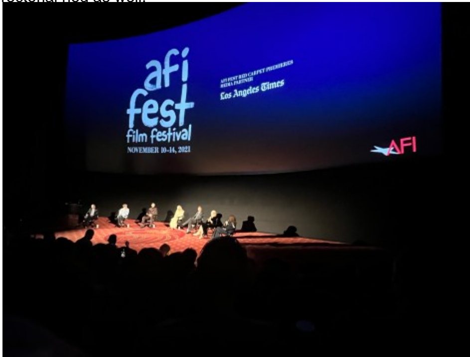
Q & A, on

While The Power of the Dog is set in Montana, the actual film location is New Zealand – adding a surreal quality. And, Campion's writing matches it full force. The twists and turns in the dramatic, psychological, roller-coaster ride narrative combined with Cumberbatch's powerful, dark character portrayal set the audience on the edge of their seats and their eyes fixed on the big screen. Undoubtedly, Campion is in the mix for her second Oscar for screenwriting and appears to be in the mix for a directorial nod as well.