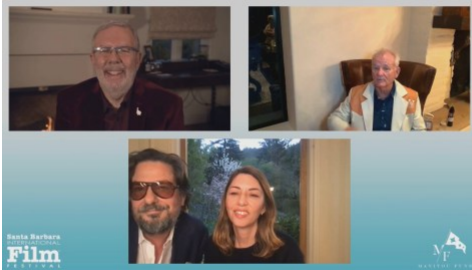
Roman Coppola, lower left, with sister Sofia Coppola, lower right, presented Bill Murray, upper right

During Murray's conversation with Maltin, guests enjoyed nostalgic clips of his film career, including Caddyshack , Ghostbusters , Groundhog Day , Rushmore , The Royal Tenenbaums , Lost in Translation , St. Vincent , On the Rocks , and more.