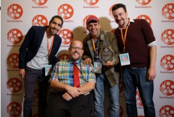
THE GARDEN LEFT BEHIND team (cast member Abo