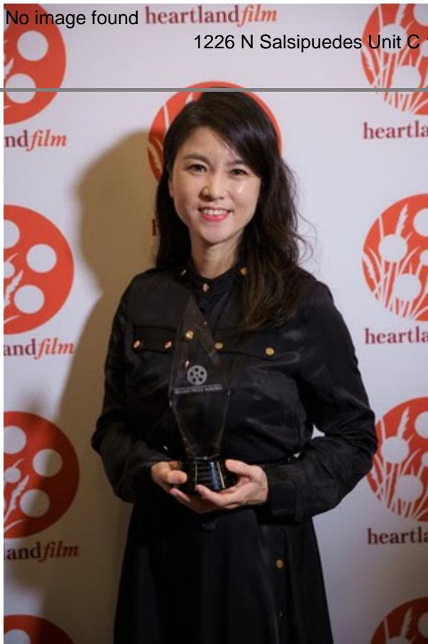
HOUSE OF HUMMINGBIRD star Seung-Yun Lee (Photo