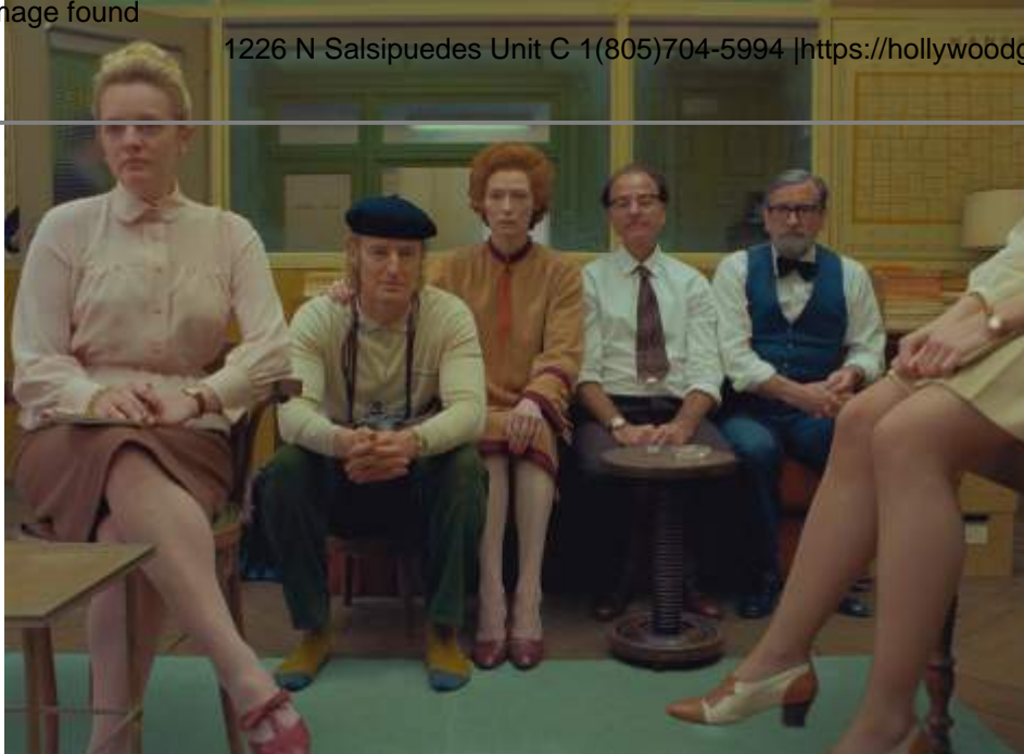
(From L-R): Elisabeth

Moss, Owen Wilson, Tilda Swinton, Fisher Stevens and Griffin Dunne in the film THE FRENCH DISPATCH .