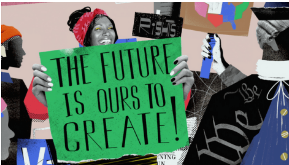
WE THE PEOPLE

The American Film Institute has gone live with its tickets and passes for the AFI DOCS 2021 festival . With 77 films from 23 countries and 4 World Premieres, with 52% of the films directed by women, 40% by BIPOC directors and 18% by LGBTQ directors, this year's AFI DOCS promises to be quite heated and equitably balanced.