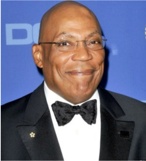
Directors Guild of America President Paris Barclay

“These phenomenal filmmakers have captured our hearts and minds, breathing life into stories rarely told and revealing worlds rarely seen,” said Barclay. “What makes this recognition truly special is the knowledge that these five directors have made a lasting impression on their peers – directors and members of the director’s team who intimately understand the blood, sweat and tears necessary to create a feature film.”