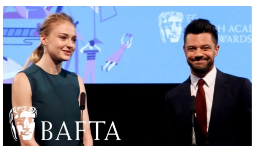
Sophie Turner, left, and Dominic Cooper announce the British Academy Film and Television Arts (Balandon.

On 10 January, the nominations for the British Academy Film Awards in 2017 were announced by Sophie Turner and Dominic Cooper.