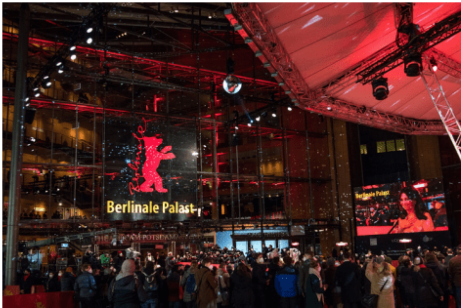
Iris Berben featured on the Red Carpet and Big Screen at the 2022 Berlinale Opening Gala (Photo of Berlinale)

Despite the ongoing pandemic, the Berlinale 2022 was able to take place as an in-person festival in compliance with a strict hygiene and security concept, and the organizers were delighted with the lively interest shown by the public and trade visitors. Due to the pandemic, only 50 percent of seats in the cinemas were occupied. This stipulation was enthusiastically accepted and a total of 156,000 tickets were sold. The Berlinale also took to the spotlight as a media event.