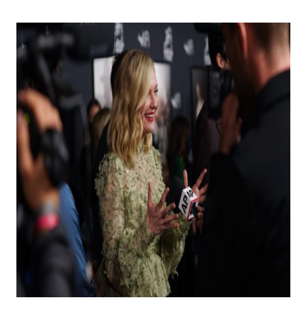
AFI FEST 2021 - Day 2 @AFIFEST