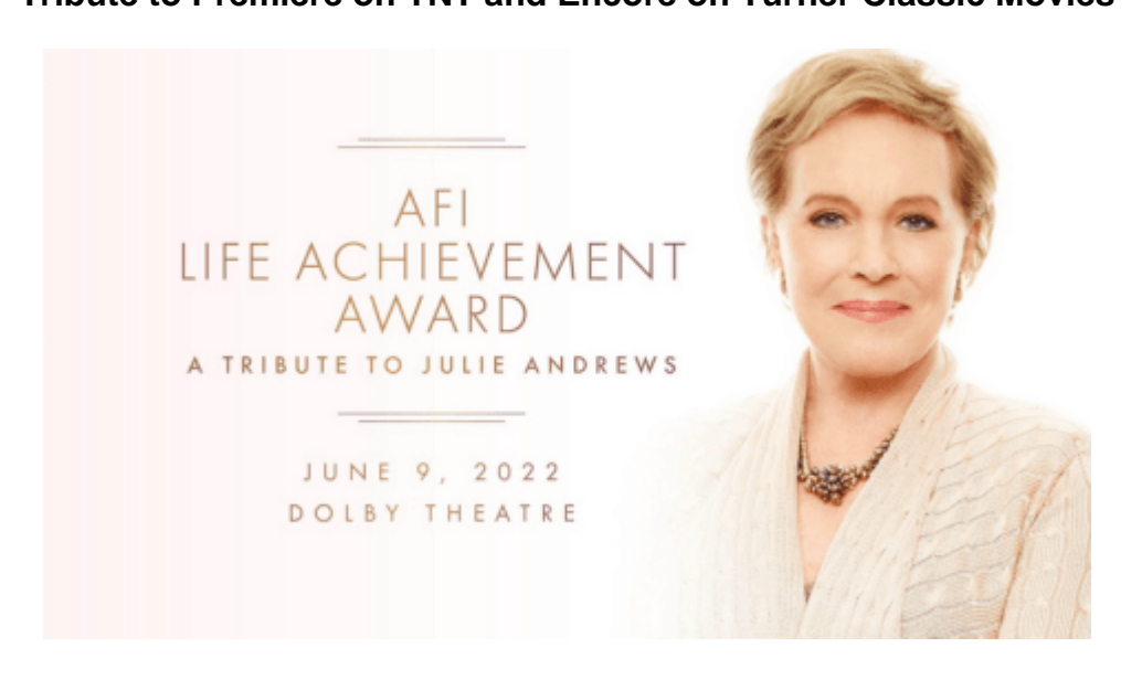
Gala Tribute To Take Place June 9, 2022 Tribute to Premiere on TNT and Encore on Turner Classic Movies