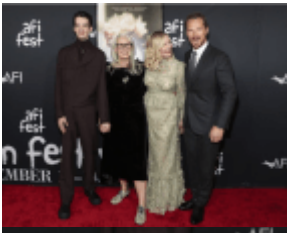
on – AFI FEST 2021 e Screening of THE OG, TCL Chinese s, California, Nov. 11