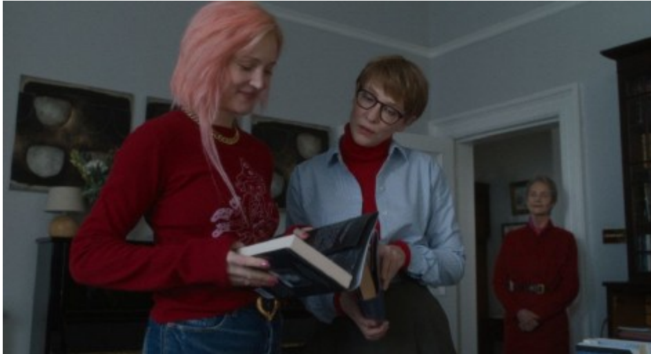
Jim Jarmusch's Venice Golden Lion Winner FATHER MOTHER SISTER BROTHER

This year's festival lineup includes 7 Red Carpet Premieres, 12 Special Screenings, 14 Luminaries selections, 15 Discovery films, 20 World Cinema selections, 15 Documentaries, 6 After Dark titles, 44 films in the Short Film Competition, and 23 films from the AFI Conservatory Showcase presented by AMC Networks. There are 5 World Premieres, 5 North American Premieres and 5 U.S. Premieres. Of the official selections, 39% are directed by women and 29% are directed by BIPOC filmmakers.