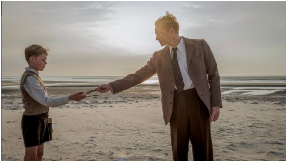
Fatih Akin's AMRUM