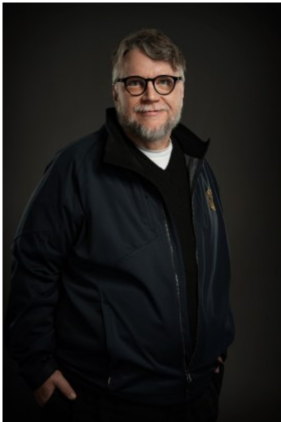
Frankenstein. Writer/Director/Producer Guillermo del Toro of Frankenstein.

Canva is the exclusive Presenting Sponsor of AFI FEST. FIJI Water is the festival’s Official Water Sponsor.