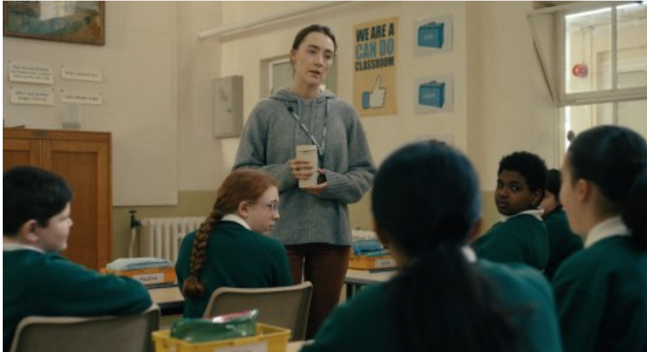
Special Screenings section, BAD APPLES

26 with the World Premiere of SONG SUNG BLUE. Gala Screenings include JAY KELLY on Thursday, October 23, NUREMBERG on Friday, October 24, DEAD MAN'S WIRE on the afternoon of Saturday, October 25, and CHRISTY on the evening of Saturday, October 25 and the World Premiere of THE SPONGEBOB MOVIE: SEARCH FOR SQUAREPANTS on the afternoon of Sunday, October 26.