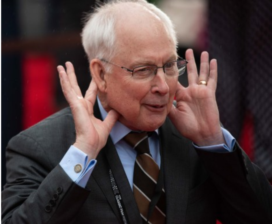
Ben Burtt on the 2023 TCM Classic Film Festival red carpet

For the first time since the 1950s, the TCM Classic Film Festival, in collaboration with Paramount Pictures, will host screenings of VistaVision films. Unlike standard 35mm film, which runs vertically through the camera, VistaVision shoots the negative horizontally, exposing the image across two 35mm frames. Using VistaVision projectors specifically installed for the festival, TCM will showcase two rare VistaVision prints: Gunfight at the O.K. Corral (1957) and Weâ??re No Angels (1955) and will feature this yearâ??s Academy-award winning cinematographer Lol Crawley. These screenings present an exceptionally rare opportunity to see VistaVision as it was meant to be experienced: on the big screen, in stunning clarity and with Perspecta audio.