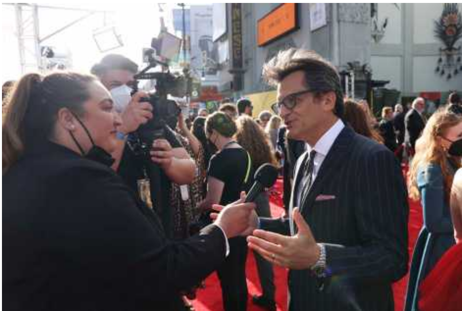
Ben Mankiewicz attends the 40th Anniversary Screening of E.T. The Extraterrestrial (1982) at the TCL Chinese Theatre during Opening Night of the 2022 TCM Classic Film Festival.

Movie lovers from around the globe will descend upon Hollywood for the 16th edition of the TCM Classic Film Festival, set to take place Thursday, April 24 – Sunday, April 27, 2025. Over four packed days and nights, attendees will be treated to an extensive lineup of great movies, appearances by legendary stars and filmmakers, fascinating presentations and panel discussions, special events, and more.