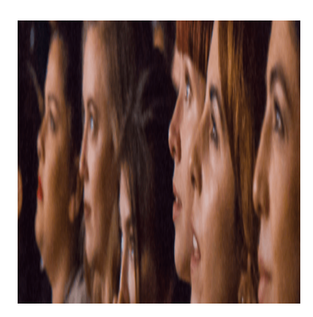
AFI FEST 2021: LGBTQ Films