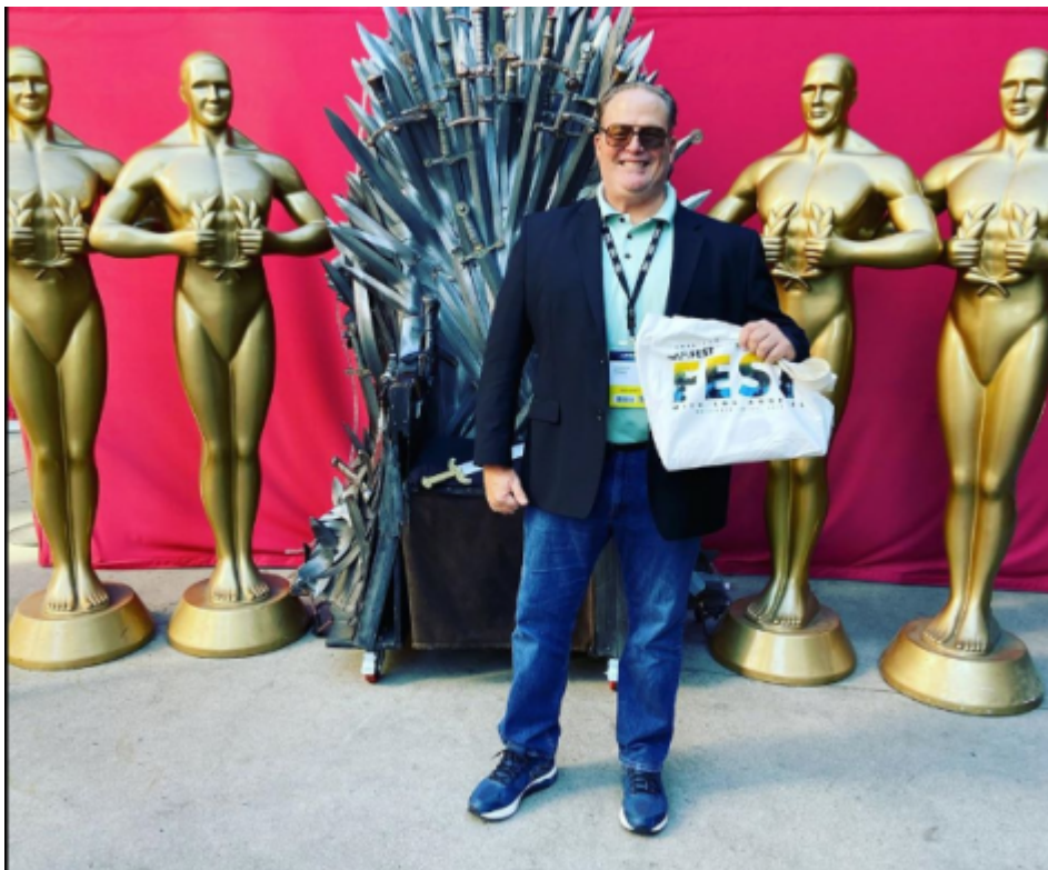
HollywoodGlee celebrating the start of the 2019 AFI FEST presented by Audi.

With the 2021 AFI FEST starting this week, here are the programming team's top picks: