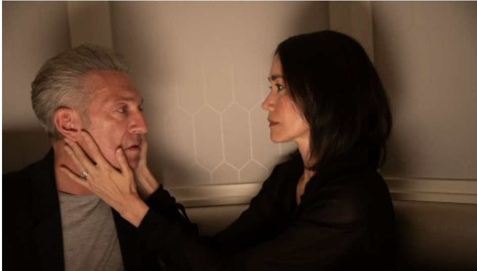
Vincent Cassel and Sandrine Holt

Naturally, any thriller needs conspiracies, and The Shrouds has several involving the Russians, the Chinese, Karsh's techie brother-in-law (played by Guy Pearce), the environmental movement based out of Iceland, his wife's physician who also was his wife's ex-beau, and the role of an angel Hungarian investor and his incredibly seductive wife (portrayed by Sandrine Holt). However, one conspiracy involving Maury and his wife leads to a desperate and wanton coupling between Karsh and Maury's wife who is also Karsh's dead wife's sister (also portrayed by Kruger). This is where the plot really heats up, literally and figuratively, and begins reconciling the film's various themes of grief, religion, technology, espionage, capitalism, and environmentalism.