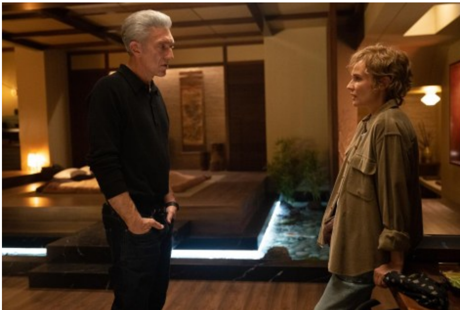
Vincent Cassel and Diane Kruger

Naturally, any thriller needs conspiracies, and The Shrouds has several involving the Russians, the Chinese, Karsh's techie brother-in-law (played by Guy Pearce), the environmental movement based out of Iceland, his wife's physician who also was his wife's ex-beau, and the role of an angel Hungarian investor and his incredibly seductive wife (portrayed by Sandrine Holt). However, one conspiracy involving Maury and his wife leads to a desperate and wanton coupling between Karsh and Maury's wife who is also Karsh's dead wife's sister (also portrayed by Kruger). This is where the plot really heats up, literally and figuratively, and begins reconciling the film's various themes of grief, religion, technology, espionage, capitalism, and environmentalism.