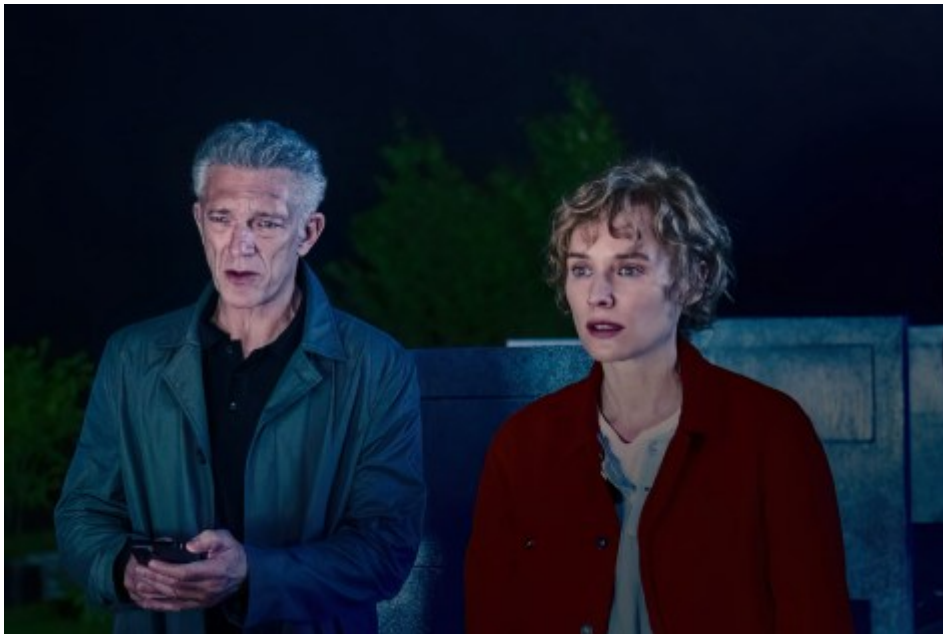
Vincent Cassel and Diane Kruger

Cronenberg opens the film with an ethereal prologue of an image of some sort of protoplasm floating in the ether. From a brilliantly executed match cut leads the viewer into the real world of Karsh (Vincent Cassel), the filmâ??s protagonist, and his mouth. Karsh is in the dental chair. His dentist has diagnosed Karsh with tooth decay caused by grief. The empathic dentist fixes Karsh up on a blind date with an attractive woman who closely resembles his deceased wife. His date is mortified when Karsh meets his date at a restaurant in the cemetery next to the Grave Tech burial plots. Karsh feels the need to take his date outside for a private viewing of his Grave Tech creation. These early events set the tone of the film and the audience reaction almost overwhelmingly energetic.