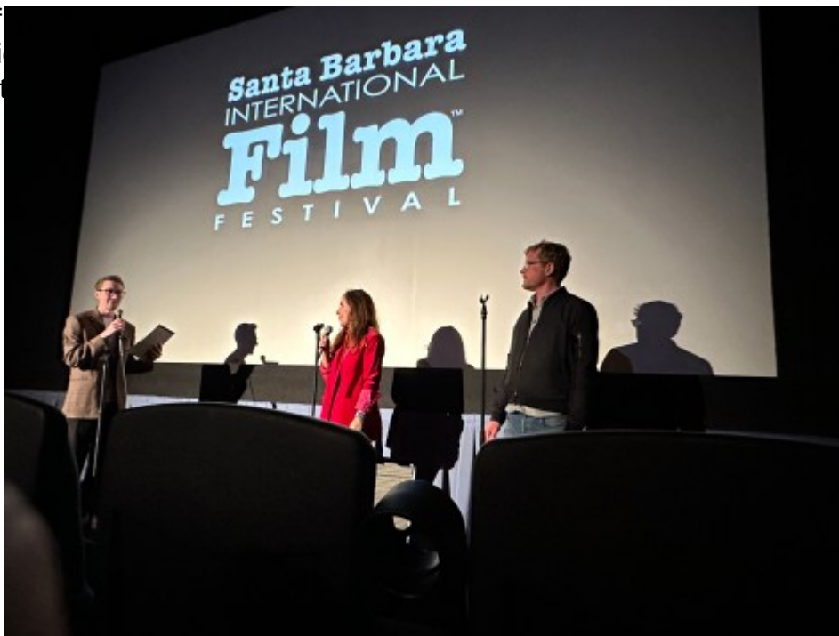
SBIFF Q&amp;A with

Grab, featuring investigative reporting.